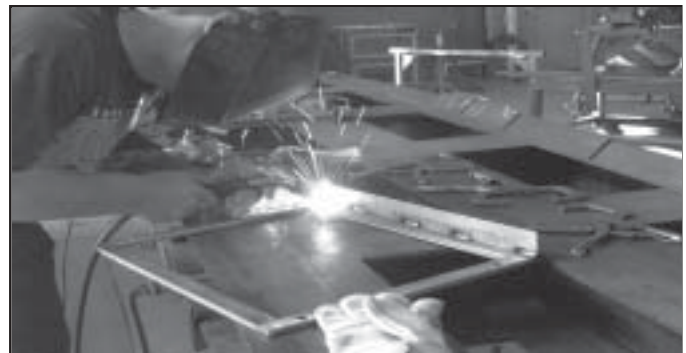
Design, fabrication, & installation/erection.

In the shop, our welders work on custom-designed work tables to allow them to quickly adapt to your welding needs. In our "clean room" we fabricate precision machine parts as well as architectural-grade metalwork. For situations that demand on-site fabrication or modification, we have fully equipped rigs.