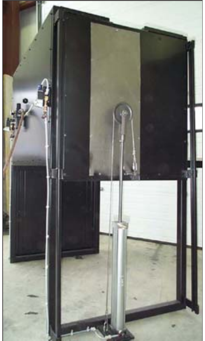
Machines made to your specifications