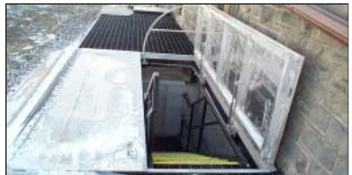
Detailing, fabrication, & erection